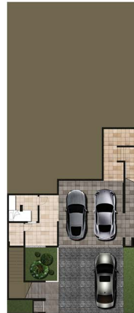
Ground Level 0 1 2 5m